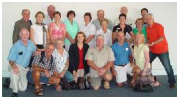
Leaving on a jet plane to Norfolk Island, we know when we will be back again