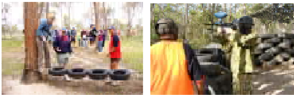
Rylarians enjoying the adventure activities-low ropes course, paint ball

Speakers included a professor, police officer, a PDG of Rotary, radio station manager, toastmaster, lawyer, an international business manager and professional speaker imparting their knowledge and expertise on a range of subjects covering leadership, life skills, team building, communication, health and human performance, goal setting, group dynamics, public speaking, debating and community service.