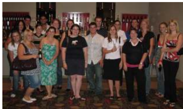
Members of the Rotaract Club of Gladstone